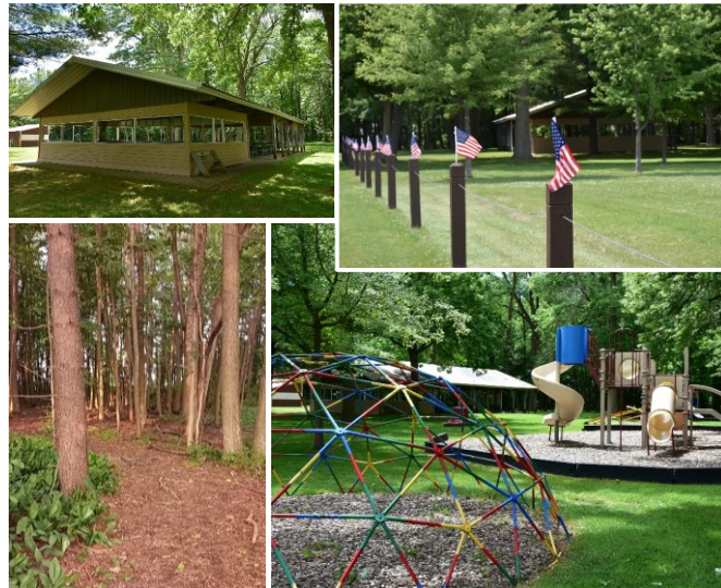
Trail access at park or Keller St.

PARK FACILITIES AVAILABLE FOR PRIVATE RENTAL